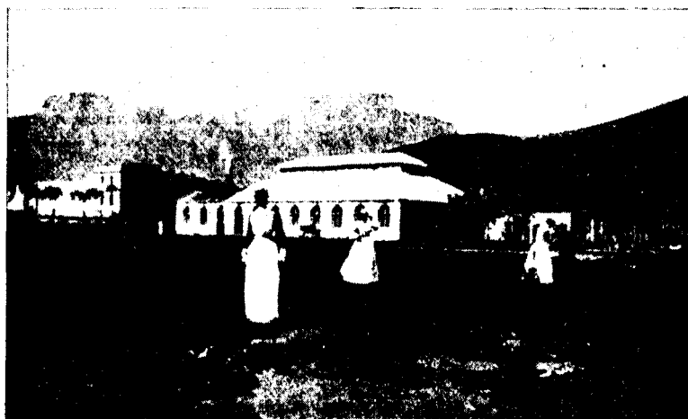
LAUNDRY, SOMERSET HOSPITAL, CAPE TOWN.

His Majesty the King last week paid a visit to the Midhurst Sanatorium, and remained at the institution for an hour. On his departure he expressed his